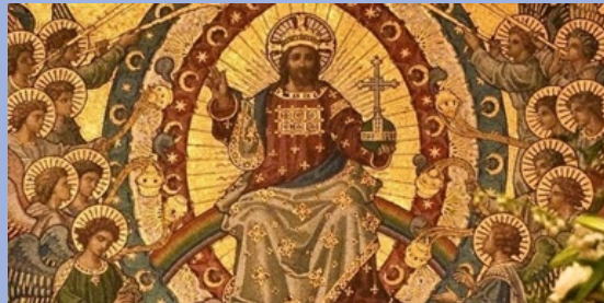
Christ the King (Final Sunday after Pentecost)

www.standrewskentct.org * 860.927.3486 * st.andrew.kent@snet.net